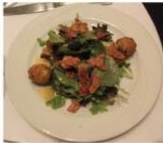
Mixed Greens with Fried Goat Cheese Croquettes, Honey-Spiced Almonds and Pickled Golden Beets