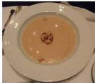
Lobster-Roasted Parsnip Bisque