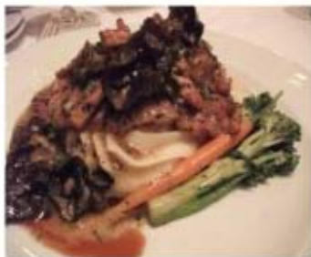
Chicken Forestière with Wild Mushrooms