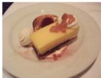
Lemon Bar with Raspberry Jam, Italian Meringue and Lemon Gelato

What they don't mention on the menu are the special accoutrements provided in between courses. The amuse bouche, French for a tiny bite-sized morsel traditionally served before the first course of a meal, consisted of delicately prepared carrots and beets, topped with caviar, curly parsley and crystallized lemon peel, accompanied by crème fraiche. The intermezzo, Italian for a composition which fits between other musical or dramatic entities, but in this case a meal; was a lemon cucumber sorbet. The flavor brought me right back to a soothing, calm place such as a day spa when cucumber water is provided after a luxurious massage. A perfect treat to enjoy before my main course.*