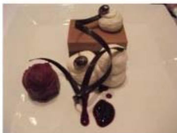
Demitasse-Chocolate Cheesecake with Gold Dusted Coffee Beans