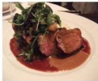
Pork Tenderloin with Braised Radicchio and a Carmelized Apple Arugula Salad